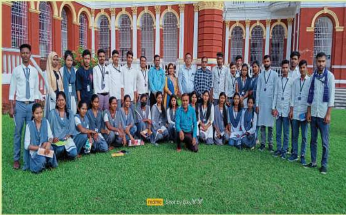
Heritage site visit from College Students