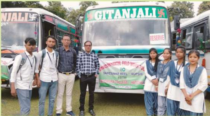
Environmental Field Study