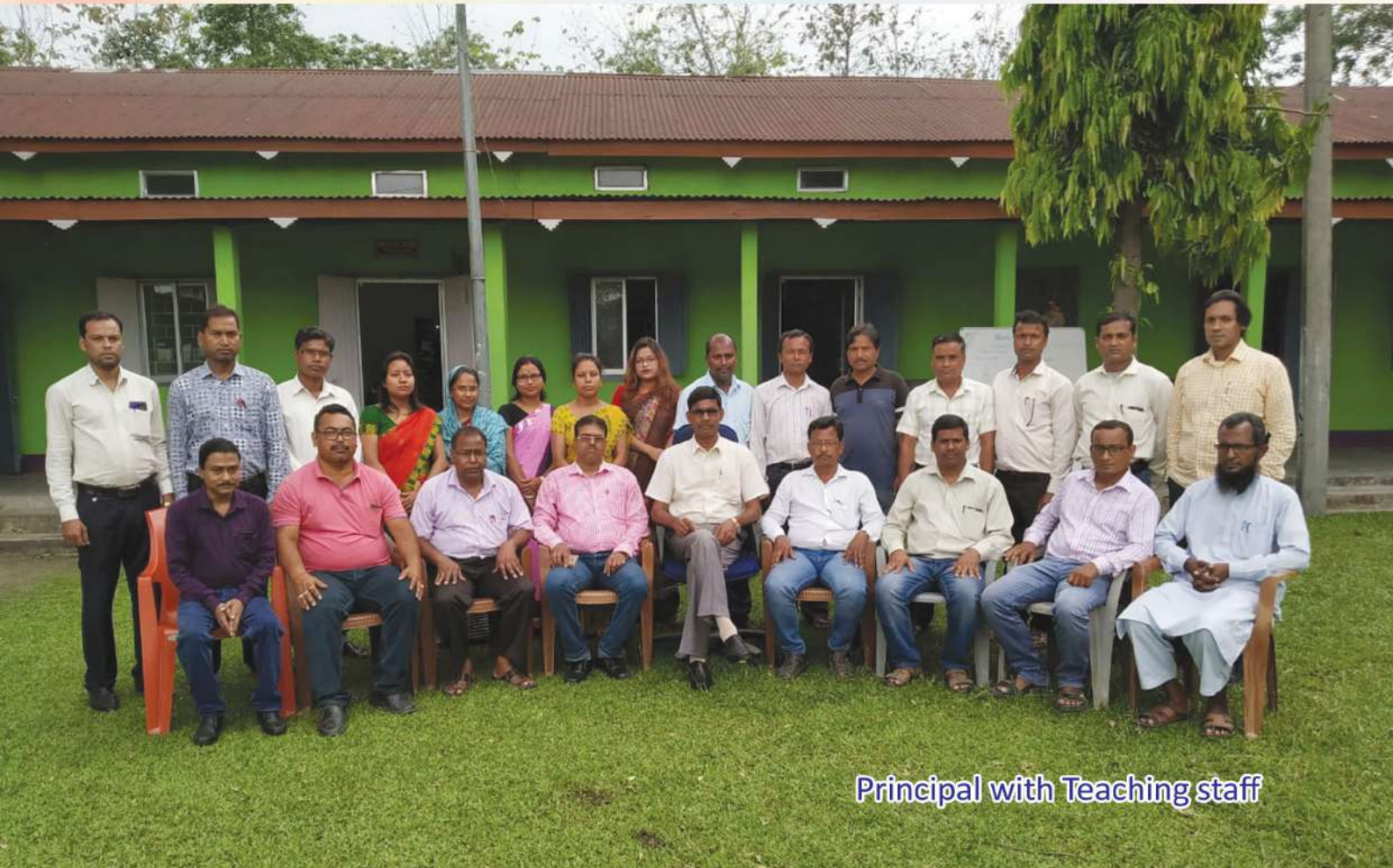
Principal with Teaching staff

The College provides exquisite facility of Girls' Hostel. There are two Hostels for girls.