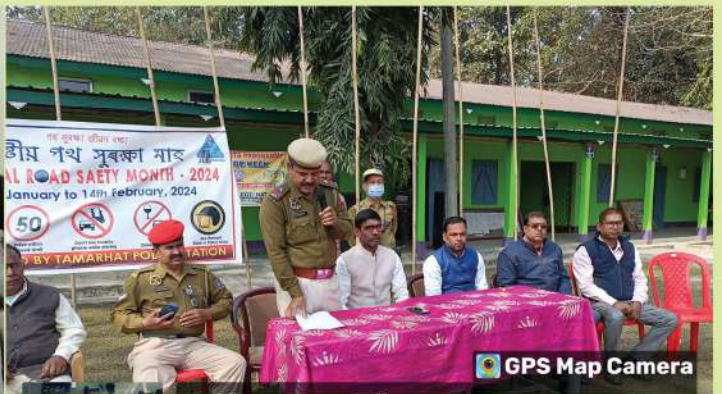
National Road Safety Month