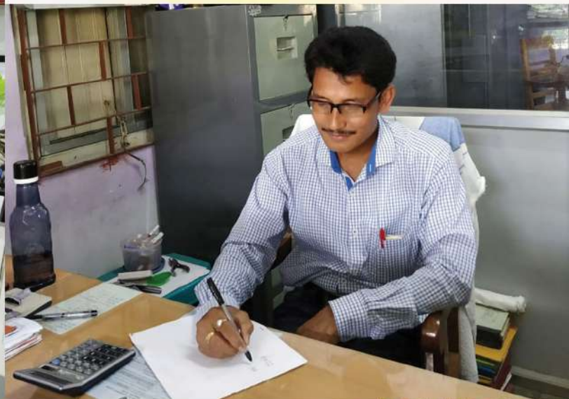
Principal with Non-Teaching Staff