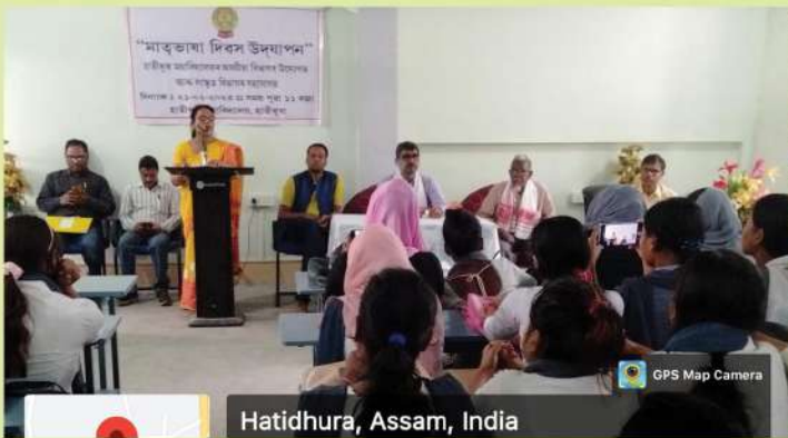
Celebrate "Matrihasha Divas"